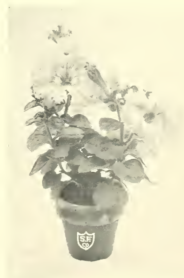
3-inch pot Pride of Portland Petunia showing quality.

All seed is from hand pollinated flowers only. Our seed is all put up in trade packets containing from 12 to 15 hundred seeds at 75 cents per packet, or 3 packets for $2; 7 packets for $4.